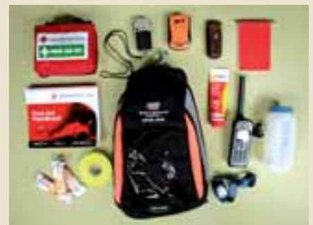
The safety grab bag provides reserve managers with a quick and easy solution to staying safe on your reserves.

Bush Heritage has never had a situation arising out of serious injury and our new grab bag offers another layer of safety to this excellent record. Bush Heritage supporters can rest assured that the people you support in the bush will come home safe, ready to do their important work again tomorrow.