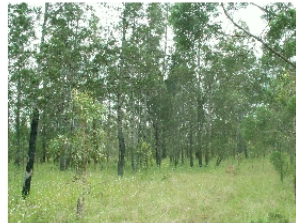
3 Woodlands and open-woodlands