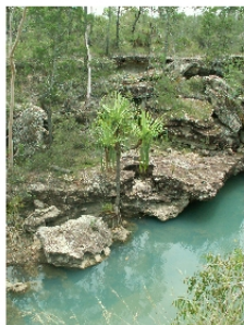
Tributary of Sunday Creek