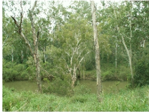
1 Woodlands and open-woodlands on heavy soils on rolling plains