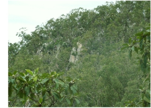
5 Dry woodlands, often on coarse sandy soil, on undulating to hilly terrain.