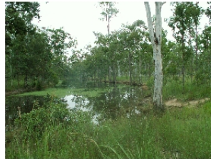
2 Eucalyptus dominated open-forest and woodlands on drainage lines or alluvial floodplains.