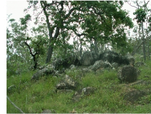
4 Moist to wet forest to woodland at moderate to high altitudes