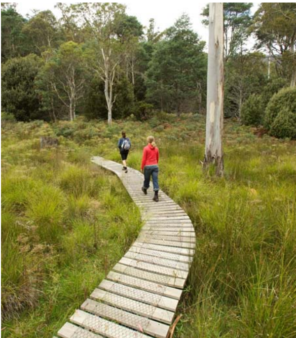
Liffey River