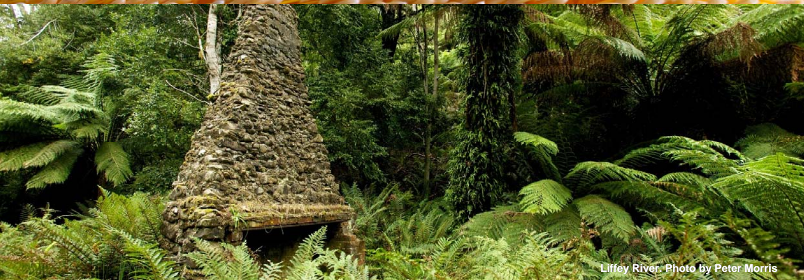
Liffey River.