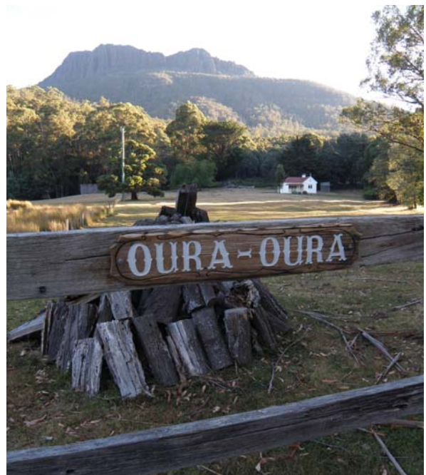
Oura Oura