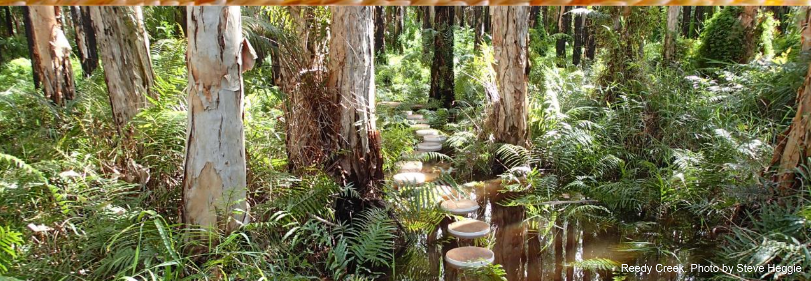
Reedy Creek.