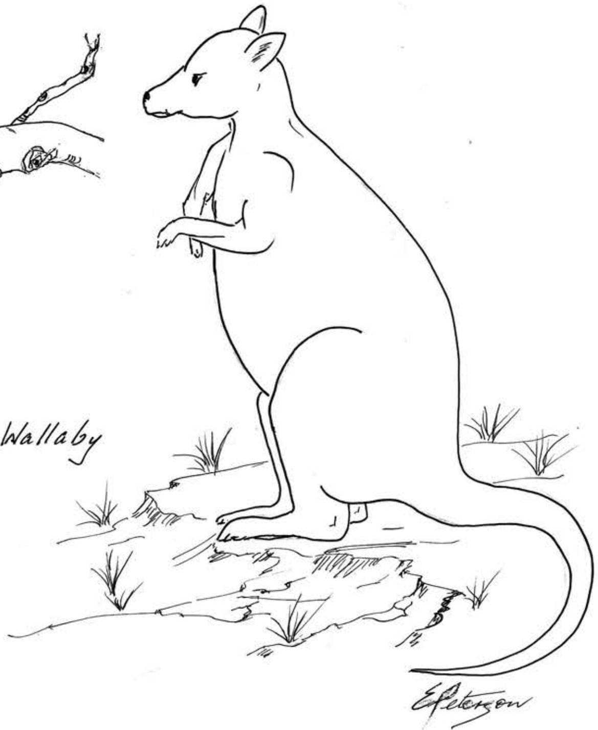
Marceba Rock Wallaby