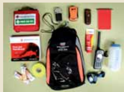
The safety grab bag provides reserve managers with a quick and easy solution to staying safe on your reserves.

Bush Heritage has never had a situation arising out of serious injury and our new grab bag offers another layer of safety to this excellent record. Bush Heritage supporters can rest assured that the people you support in the bush will come home safe, ready to do their important work again tomorrow.